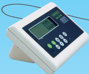
Indicator SA 250, table top version