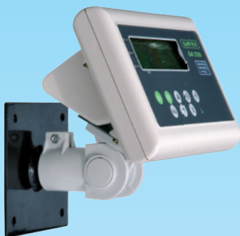
Indicator with wall mounting bracket